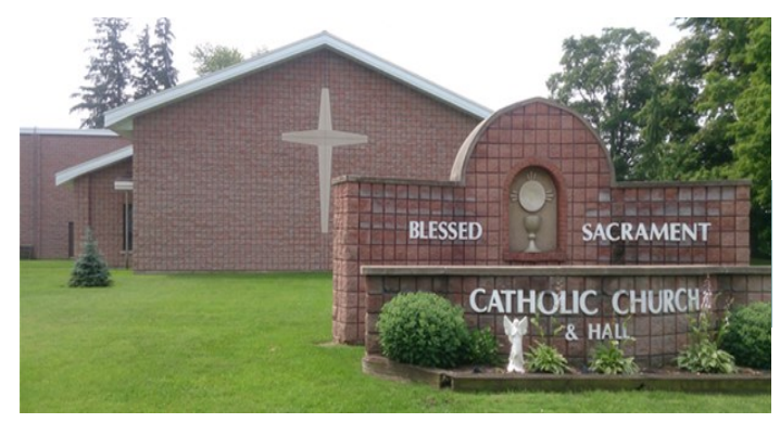
FIRST HOLY COMMUNION & FIRST RECONCILIATION 2024

The Sacrament of First Communion will be celebrated on April 28th @ 9:30am at Blessed Sacrament Church. If you have not registered, please contact the Parish Office 519 449-5143